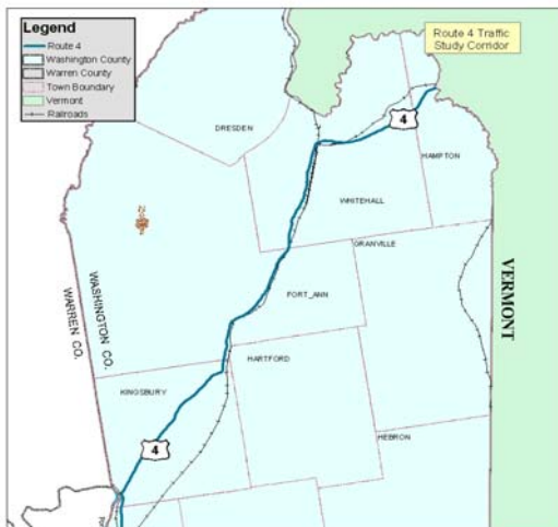
ROUTE 4 IN WASHINGTON COUNTY