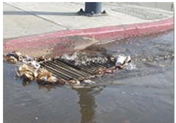
STORMWATER RUNOFF FROM A CONSTRUCTION SITE ENTERING A STORM DRAIN