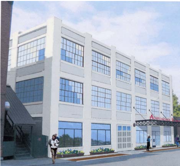
AN ARTIST'S RENDERING OF THE NEW BUSINESS INCUBATOR

The proposed Technology Center is a three-story, 20,000 square foot former textile mill, located within an Economic Development Zone and Brownfield Site in downtown Glens Falls. The City of Glens Falls Local Development Corporation (LDC) has formed a partnership with Adirondack Community College (ACC), Queensbury Economic Development Corporation (QEDC), Warren County Economic Development Corporation (WCEDC) and the Adirondack Regional Chamber of Commerce (ARCC) to acquire and rehabilitate the old manufacturing building and convert it into a state-of-the-art business accelerator/incubator complete with a clean room and wet lab facility.