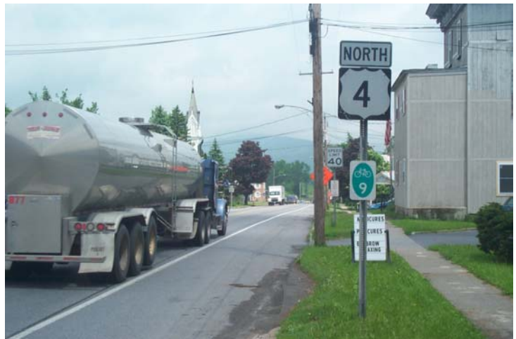
ROUTE 4 STUDY IN PROGRESS