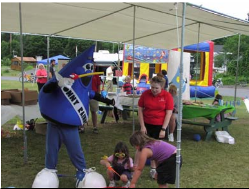
RONNIE RAINDROP AT WATERFEST

Another large part of the Environmental Planning Assistant's job is the annual Adirondack Waterfest, a family oriented event focused on water quality. This past Summer it was held at Roger's Island in Fort Edward. The Greater Adirondack Resource Conservation & Development Council (RC&D), Saratoga and Washington County Soil & Water Conservation Districts (SWCD), the Town of Fort Edward, DEC, Roger's Island Visitor's Center and several other organizations worked together